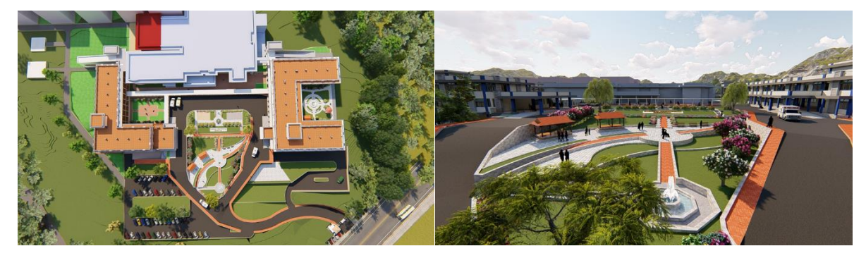
Figure 2: Landscaping and public open space Central Courtyard

• Landscaping and public open space: Designs and cost estimates for landscaping and public open space works for the Central Courtyard (see Figure 2) and Maternity Block (Figure 3) have been submitted to the MoSD.