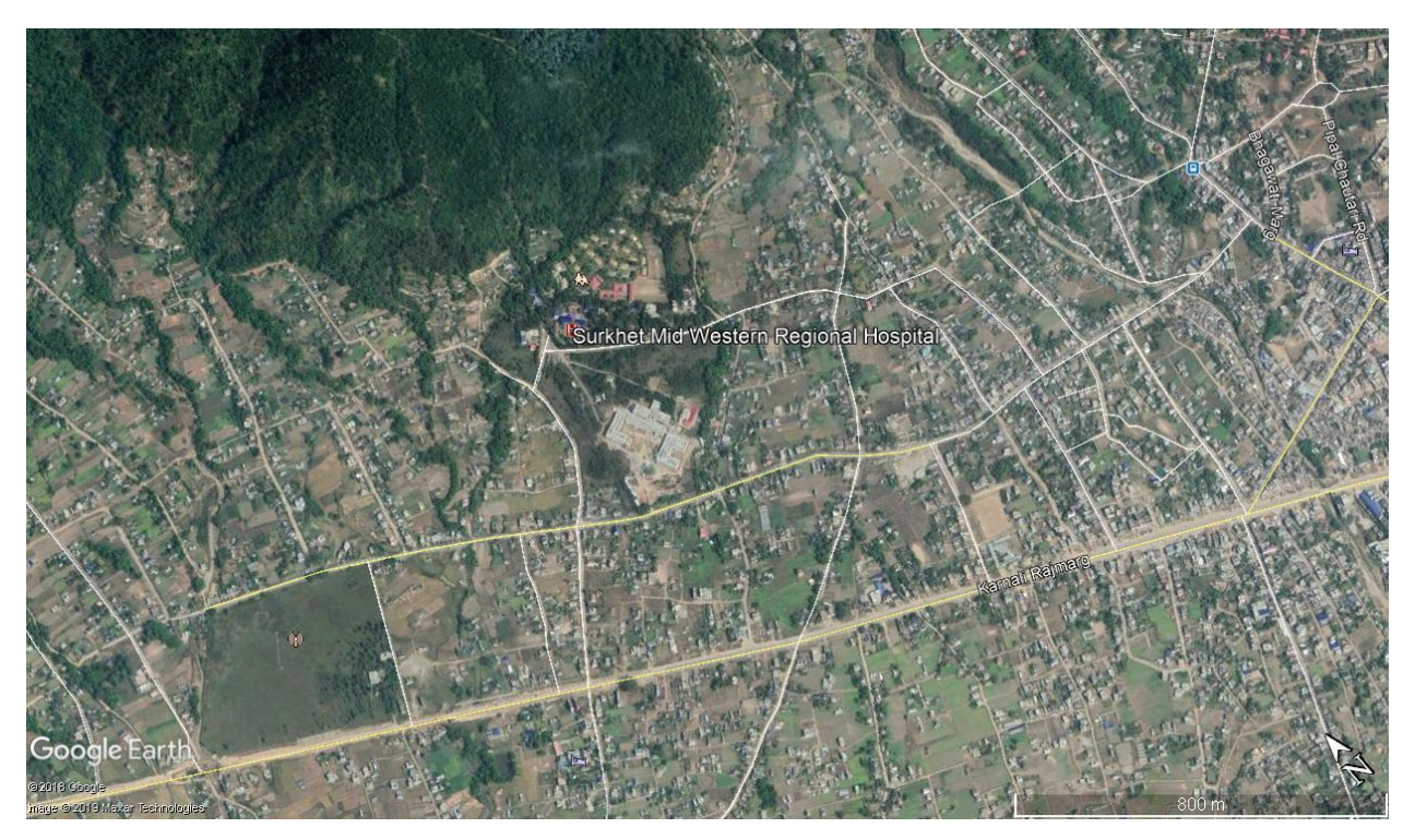
Location Map of Karnali Province Hospital

The Hospital is currently being expanded to secondary level status, with additional floors to existing buildings and new structures being built. A new building with a 300 bed capacity has been completed and handed over recently to the Government. The new Hospital is located on a large green field site located on the western side of the town of Surkhet. The site is located on the south side of the existing hospital across the road.