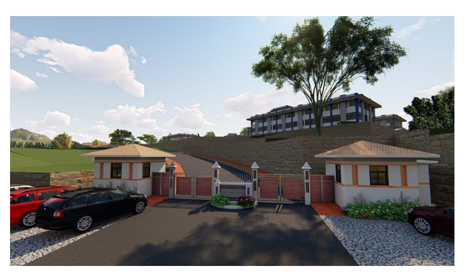
Figure 1: Design of new entrance gate and guard house at Karnali Province Hospital

• Landscaping and public open space: Designs and cost estimates for landscaping and public open space works for the Central Courtyard (see Figure 2) and Maternity Block (Figure 3) have been submitted to the MoSD.